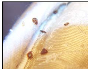
Closely Examine Mattress Seams