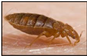
Live Bed Bugs