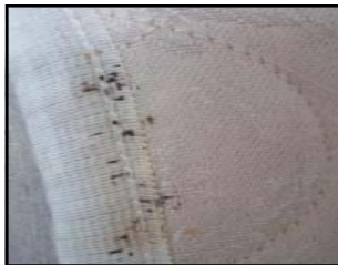
Black Speckling (Fecal Droppings)